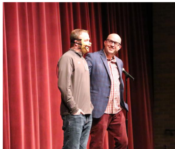
Entertains RCHS students & staff during ALL school assembly on Friday, March 22 nd